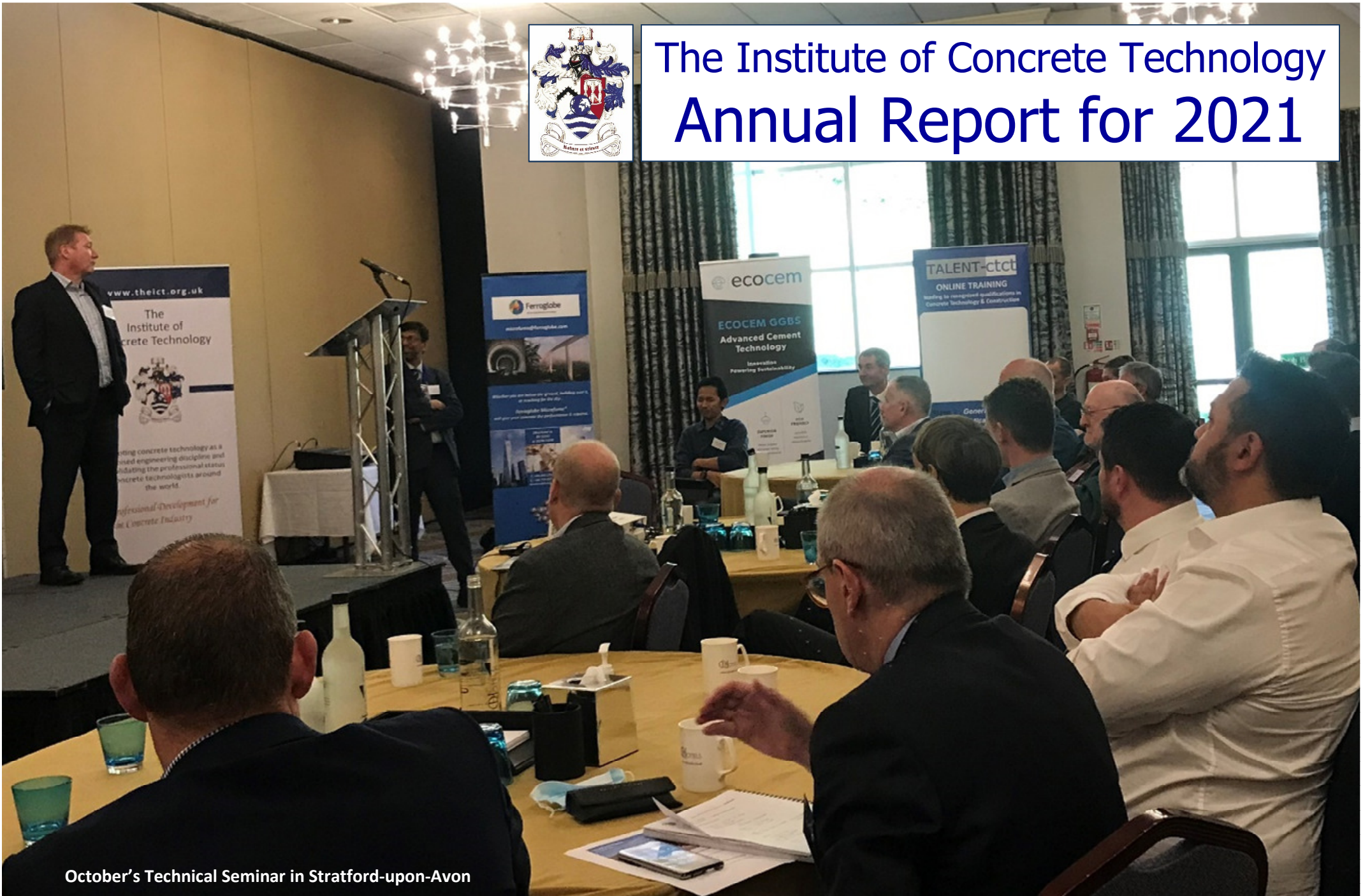
October's Technical Seminar in Stratford-upon-Avon