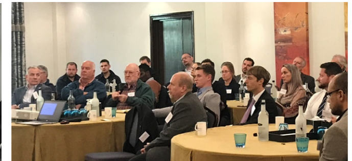
Certification of technicians continues with a session in Rochester; technical seminar and members' luncheon in Stratford.